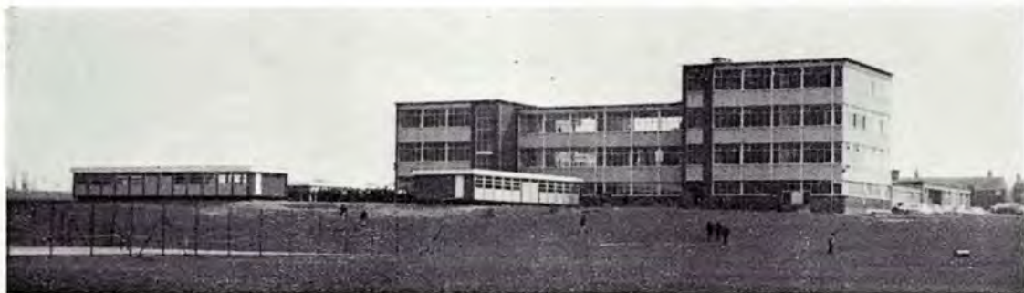
The Bryn Offa School at Wrexham. In the centre foreground and to the left are some of the new unit classrooms