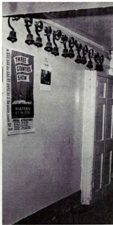
The old-fashioned call system whereby a pull on a cord in various parts of the hotel would set off one of these bells in the hallway and away would go the servant.