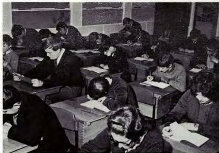
Some of the young pupils working in the comfortable warmth of their new classrooms, even with the severe weather conditions outside