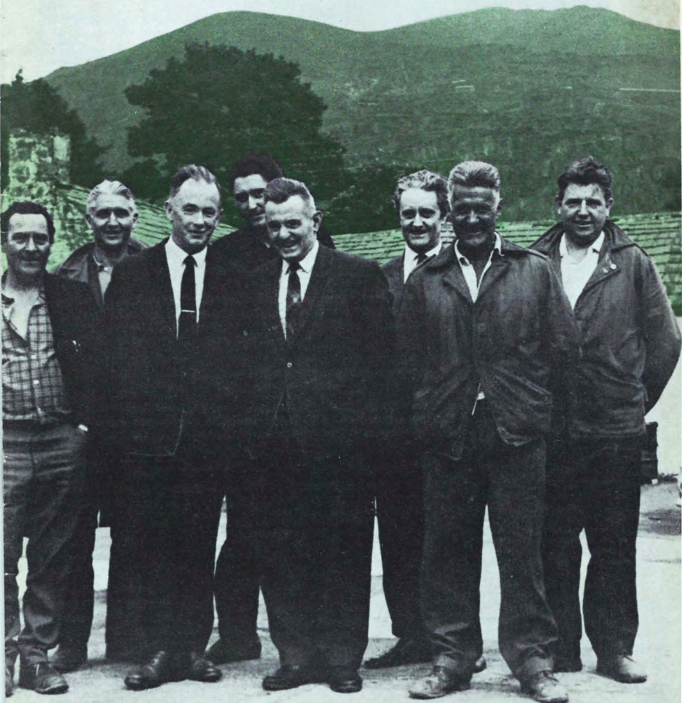
The Stern Gang (see page 161)