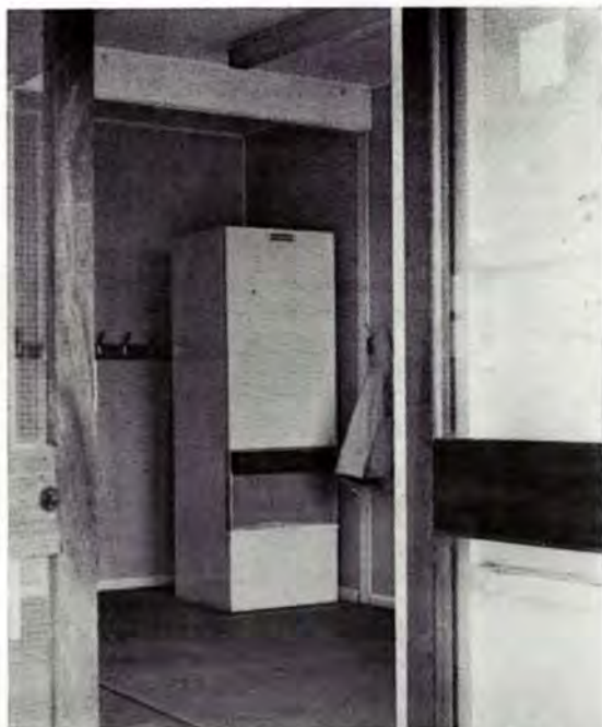
A Creda nine kilowatt Electricaire unit sited in the hallway adjoining one of the unit classrooms

4 p.m. Thermostats in the classrooms control the output from the heaters to keep the air temperatures at 68°F. The neat and compact units are sited in the entrance area—a kind of hallway—where the pupils can leave their top coats to dry-off, helped by the warm air being recirculated through the cabinet.