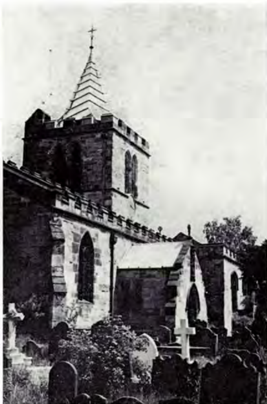
Hawarden Parish Church, a beautiful structure which took the place of the tiny wattle-and-daub church established long ago by the priest Deiniol Wyn

With the stands of the City racecourse in the background is the grave marker of The Rood