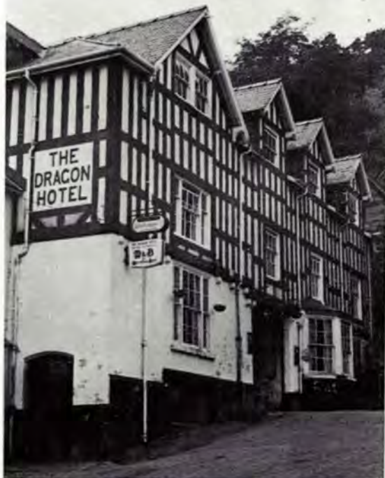
The 18th Century coaching house in Montgomery

Huge solid oak beams, some up to 18 inches thick, confronted our electricians as they took the